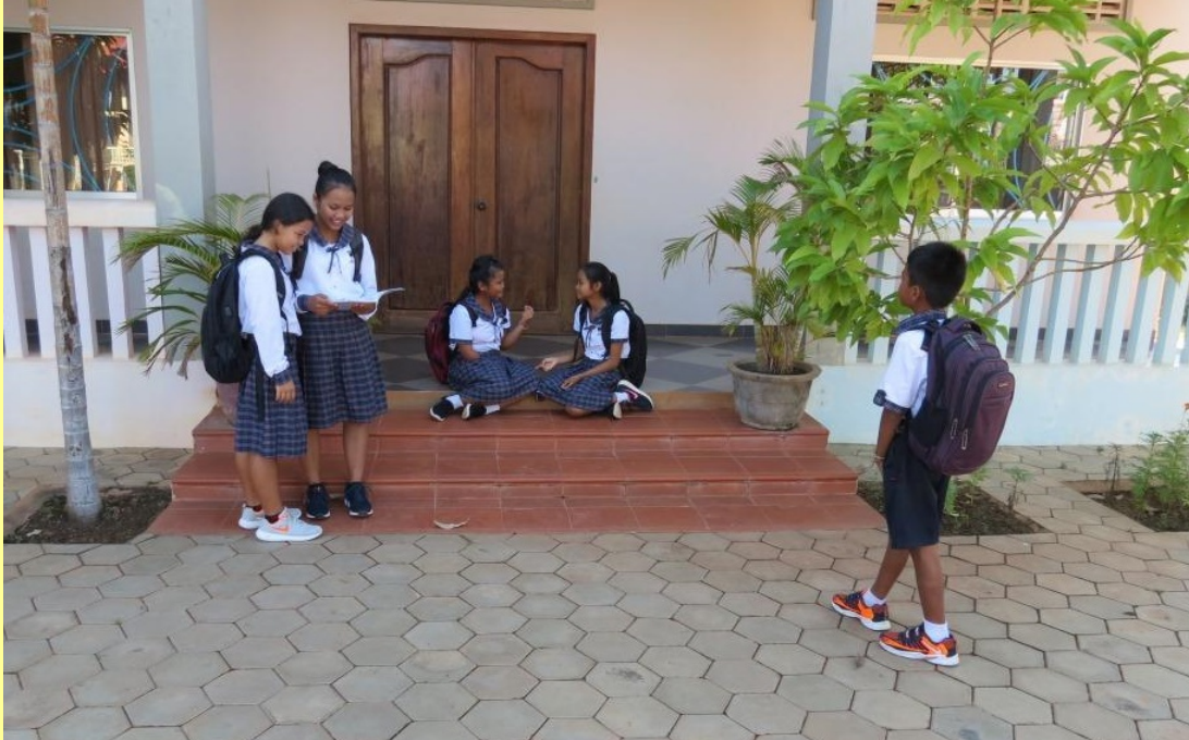
Students attending WESTERN INTERNATIONAL SCHOOL