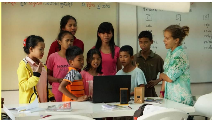
In the image the Spanish teache sharing her knowledge to some of her students.

In addition, at JAVI SCHOOL we teach English and Computer classes every day, which are compulsory for all; and three times a week, Spanish classes, for those who want to learn a widespread second foreign language. All this is developed with highly qualified local and foreigner teachers who enjoy their work.