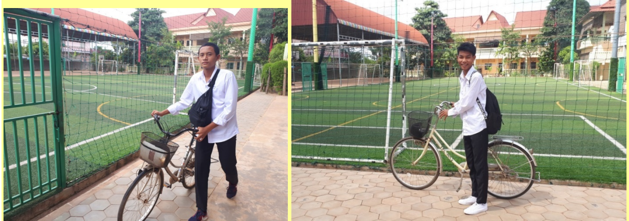
Above images, students residing in DEI KOMA-The Children's Land.

We attend public and private schools, depending on the academic results or the level of commitment. We also have a program of Scholarships in country side villages, students continue to live with their families, without the need for family detachment until reaching technical or university level courses.