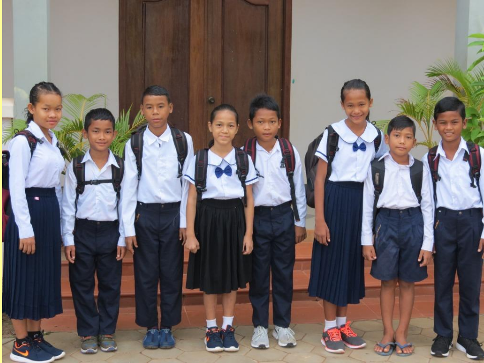
Very HAPPY the studnets in Grade Four.

In addition, at JAVI SCHOOL we teach English and Computer classes every day, which are compulsory for all; and three times a week, Spanish classes, for those who want to learn a widespread second foreign language. All this is developed with highly qualified local and foreigner teachers who enjoy their work.